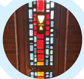
The Chalice Light of Love