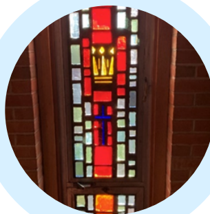
The Crown Cause of Our Joy