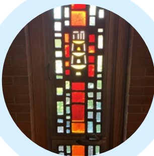
The Fountain Spiritual Vessel