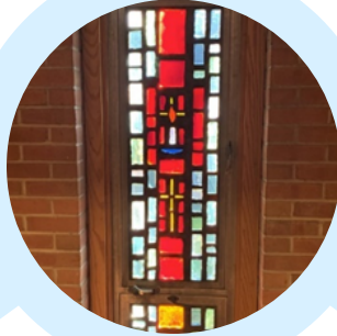
The Candle Light of Faith