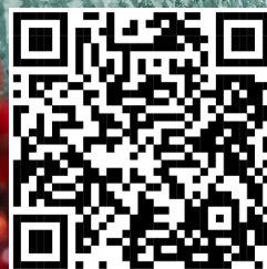
GIVING QR Code